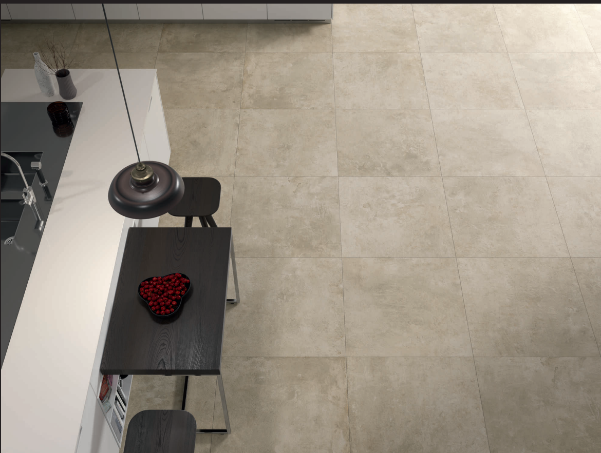
TEMPO SMOKE NATURAL 80X80