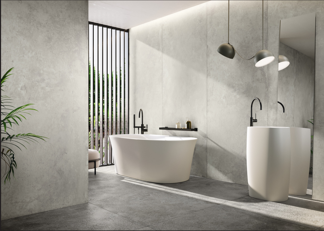
TEMPO GRIS NATURAL 100X300 • TEMPO ANTRACITA NATURAL 100X100