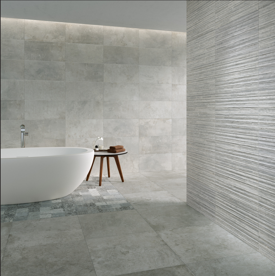
TEMPO GRIS NATURAL 30X60 • CANYON GRIS NATURAL 30X60 • CARPET 2 GRIS NATURAL 60X60 • TEMPO GRIS NATURAL 60X60