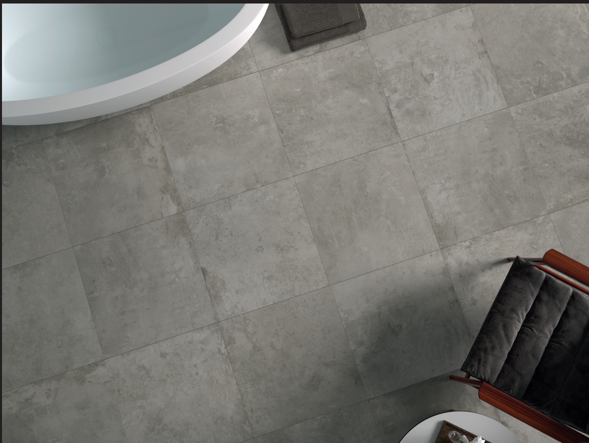
TEMPO ANTRACITA NATURAL 80X80