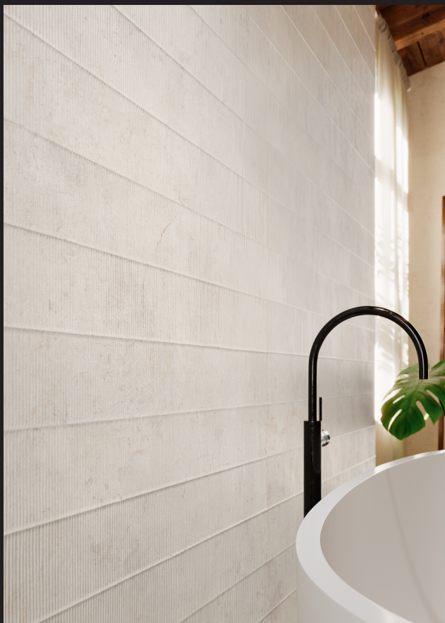
VASARI BEIGE NATURAL 31.5X100