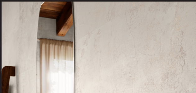
FRESCO BEIGE NATURAL 31.5X100