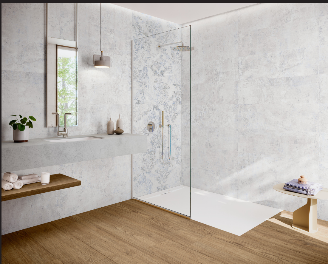
JUNGLA IROKO NATURAL 19.5X120 • FRESCO CENIZA NATURAL 31.5X100 • DONATELLO CENIZA NATURAL 31.5X100