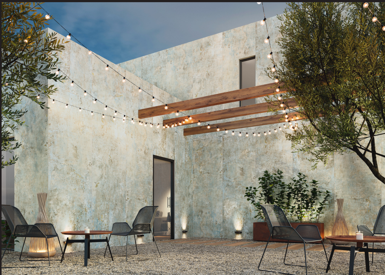
FRESCO OCRE NATURAL 100X300