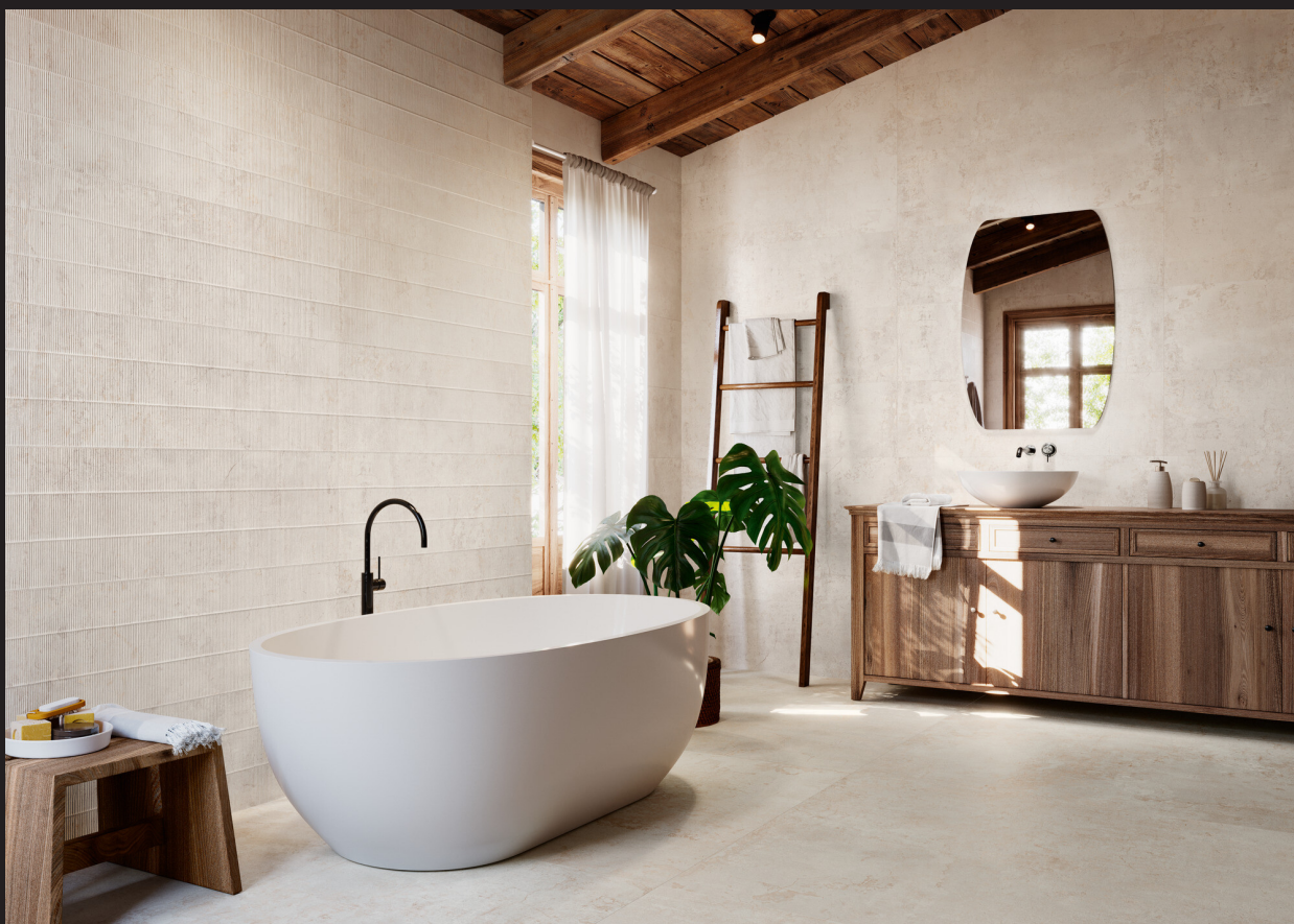
FRESCO GREIGE NATURAL 120X120 • FRESCO BEIGE NATURAL 31.5X100 • VASARI BEIGE NATURAL 31.5X100