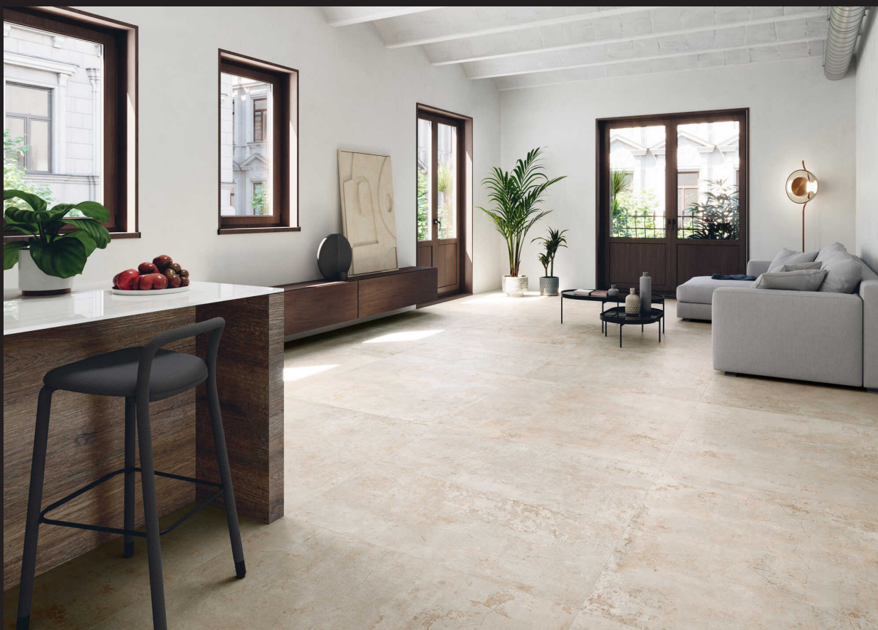
FRESCO GREIGE NATURAL 120X120